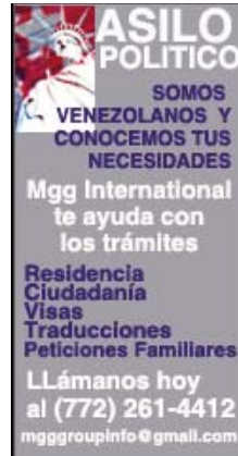
120 x 240 (Upbutton)