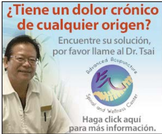
300 x 250 (Medium Rectangle)