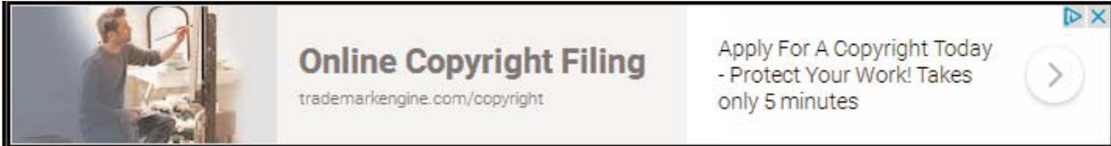
728 x 90 (Leaderboard)